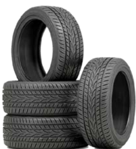
TIRES -- ON & OFF RIMS