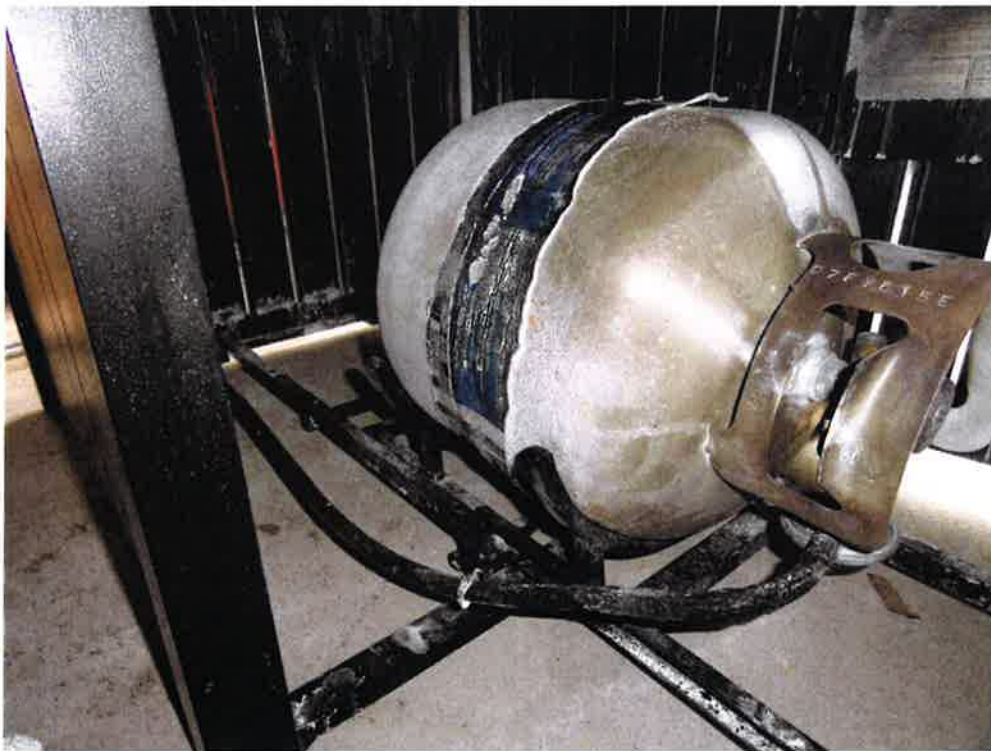
Propane Cylinder and Horizontal Cradle Assembly