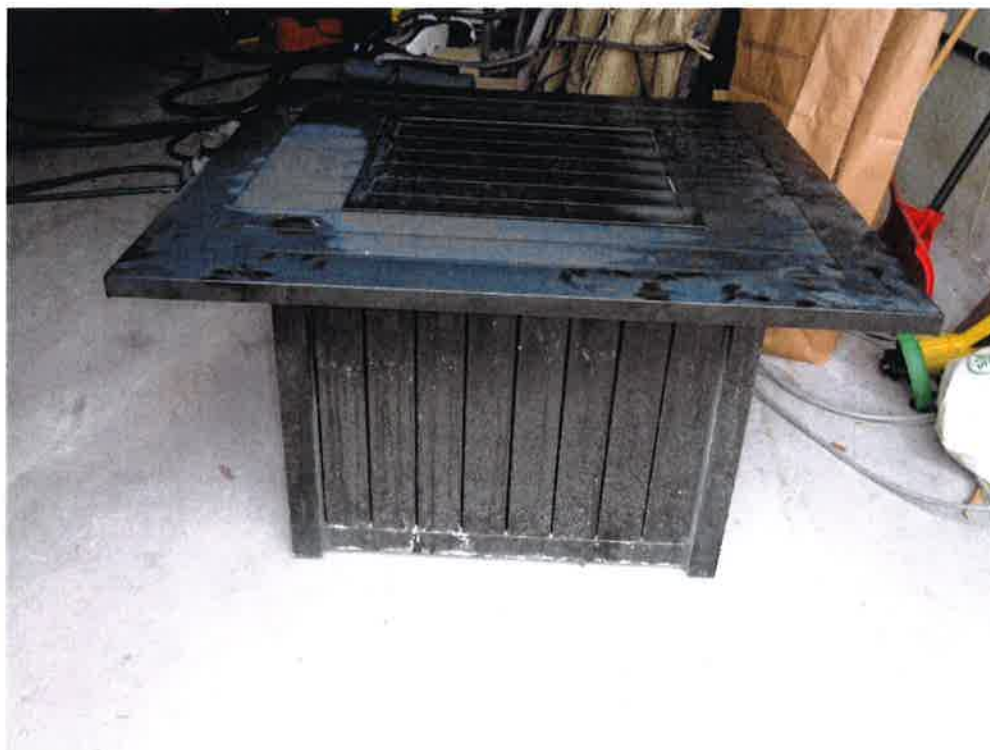
Wujiang Gaorui Garden Metalwork – WBT Series Fire Pit

Photographs of the subject fire pits and the horizontal cradle assembly are below: